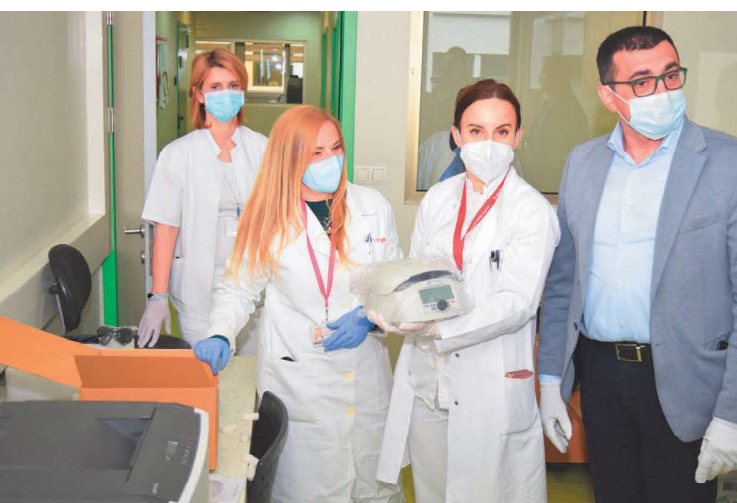
COVID-19 equipment donated by the IAEA received by staff at the Hospital Banja Luka in Bosnia and Herzegovina.