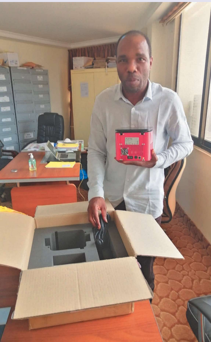
A shipment of RT-PCR equipment from the IAEA arrives in Burkina Faso.