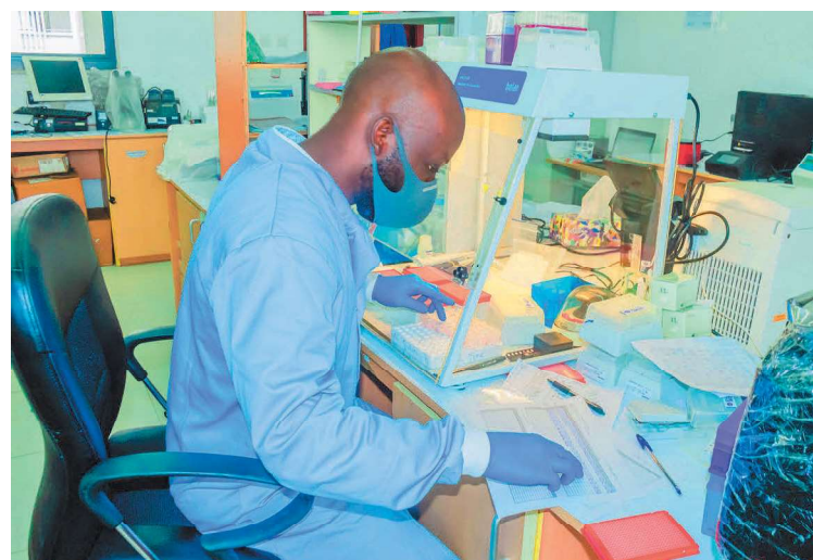
The Ghana Atomic Energy Commission handed over a set of COVID-19 testing kits donated by the IAEA to the Ministry of Health in Accra, Ghana.

The Agency, in partnership with the Food and Agriculture Organization of the United Nations (FAO), works in close cooperation with the WHO and the World Organization for Animal Health, and is a member of the WHO-led UN Crisis Management Team for COVID-19. The IAEA is taking concrete and coordinated action to support global efforts against the pandemic.