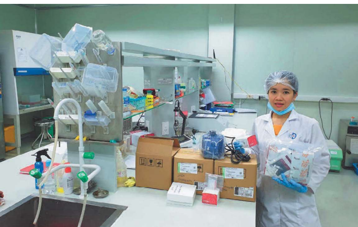
The National Centre for Veterinary Diagnostics in Viet Nam has also received equipment from the IAEA.