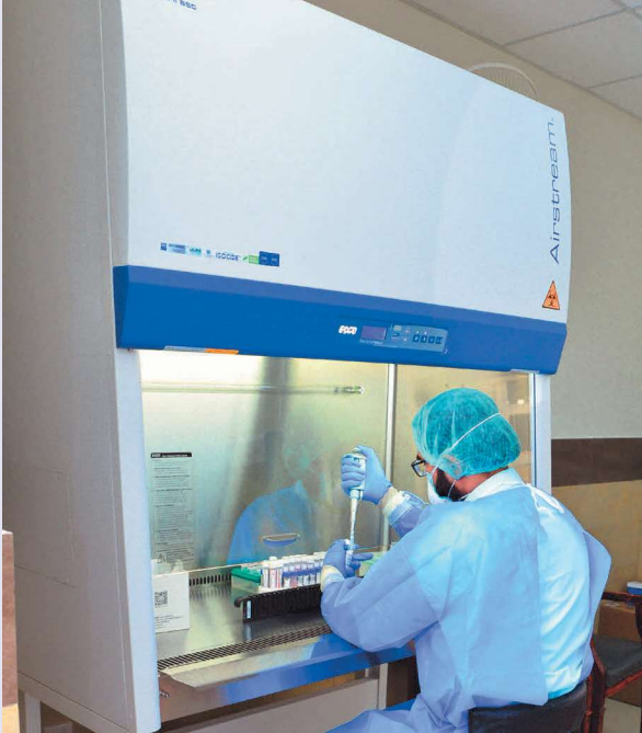
COVID-19 equipment donated by the IAEA at the General Hospital, Pakistan Atomic Energy Commission, Islamabad, Pakistan.